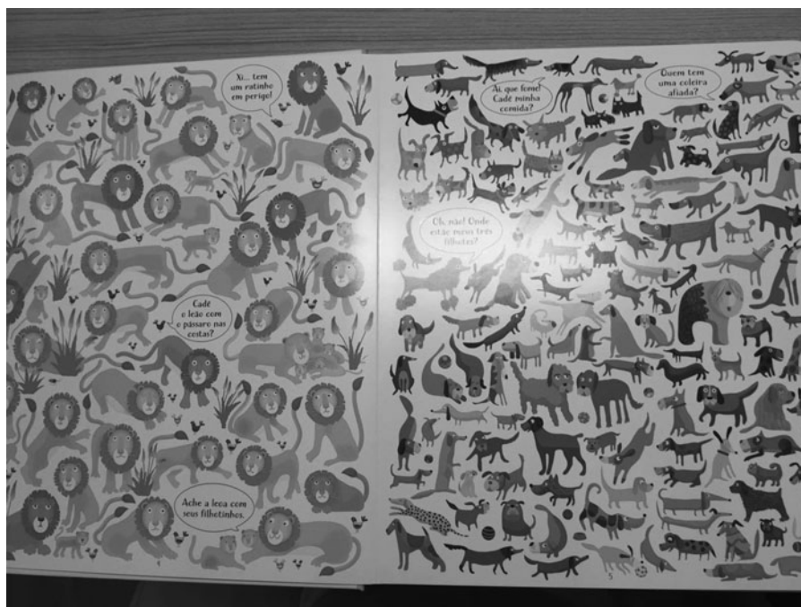
Fig. 1. A book with small figures and letters. She was asked to find a figure or letter on the page of the book as she moved her head either up or down while keeping the target in focus.

After 10 sessions of vestibular rehabilitation, L.S. reported that playing was easier, headaches had reduced, and she could ride in a car for long distances without complaints. She watched 3-dimensional action films with no symptoms and walked in a