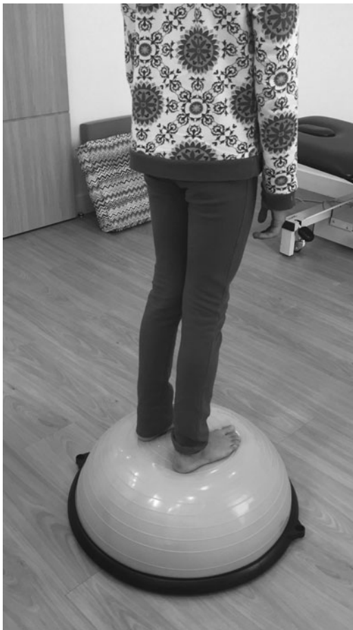
Fig. 2. Performing balance exercises on the top of a Bosu Ball.

Parental cooperation is critical in working with children and finding time to exercise before or after school can be challenging. In our case study, the child cooperated with performing her exercise program.